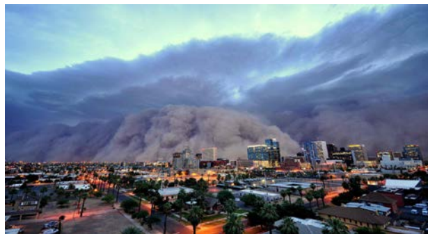
July 5, 2011 Haboob

The people who attended came away with a well-rounded idea of where the dust control industry is today and where it is going in the future.