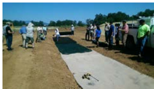
Shasta College Erosion Control Training Facility (ECTF)