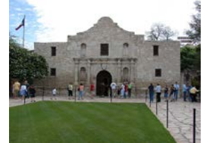
The chapel of the Alamo Mission is known as the "Shrine of Texas Liberty"!

Remember the Alamo! A battle cry in the Texans' struggle for independence from Mexico, later used by Americans in the Mexican War. It recalled the desperate fight of the Texan defenders in the Alamo, a besieged fort, where they died to the last man.