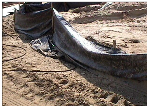
Proper maintenance is needed for this silt fence.