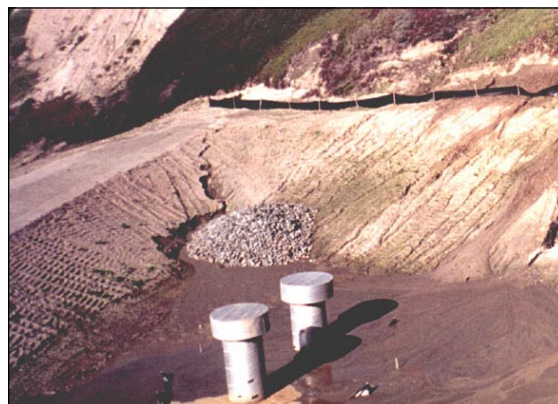
Catchment basins should be cleaned out between storm events.