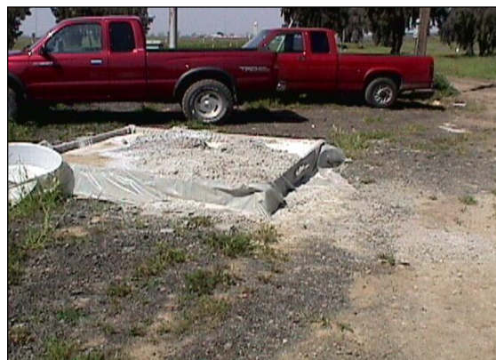
It's time to clean out this concrete washout facility.