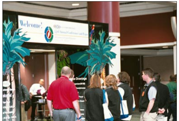
Photo highlights from Orlando 2002