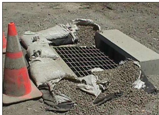
Replace damaged gravelbags.