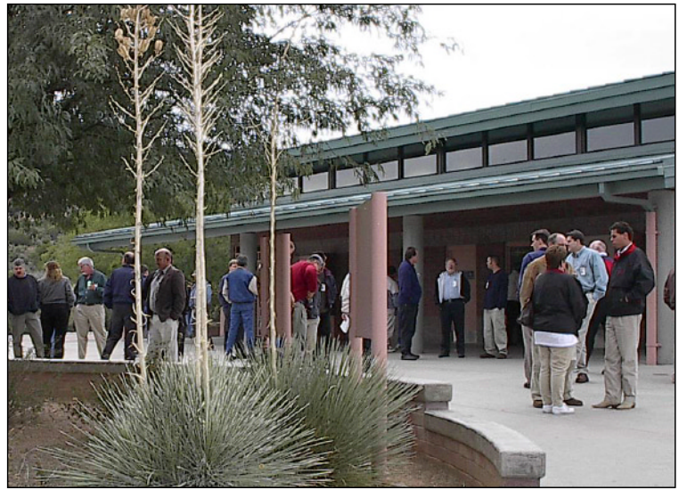
Members were able to meet with the speakers and network with other attendees.

Make plans to attend 'Adventures in Erosion Education', IECA's 33rd Annual Conference and Expo, February 25- March 1, 2002 at the Orange County Convention Center - Orlando, Florida! Complete details are available at http://www.ieca.org .