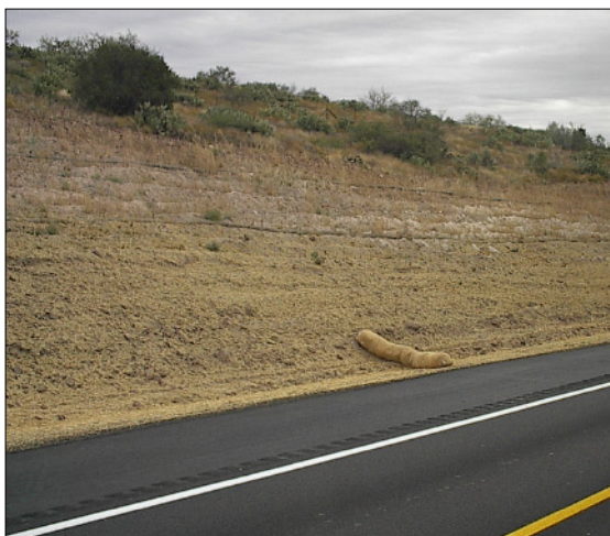
Fiber rolls installed along the roadside to reduce erosion.

The USDA Forest Service was heavily involved because the majority of the State Route 87 project was in the heart of the Tonto National